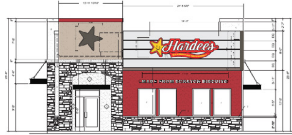
Design and drawings are complete for the new Prattville Main Street store. We are excited to start construction of the new facility early 2018.

This tool will provide us with an accurate history of repair for individual items, knowing when an item is under warranty and avoiding duplicate service calls.