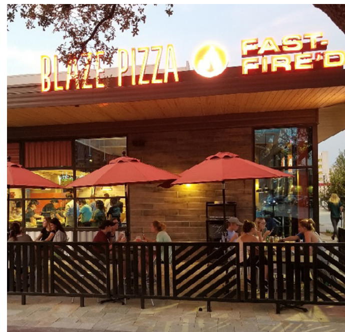
Blaze College Station - just opened!